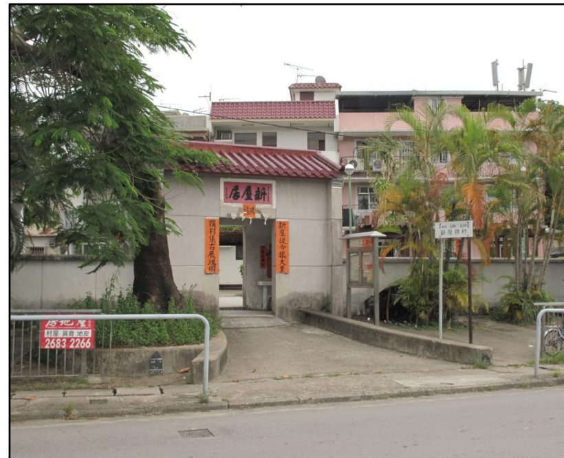
To R2 Residents of San Uk Ling