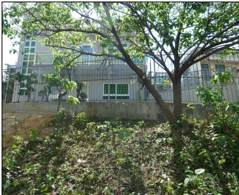
To R3 Residents of Lo Wu Village