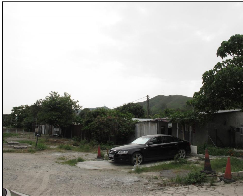
To R1 Residents of Villages along Man Kam To Road