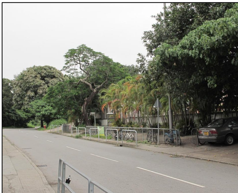
From R2 Residents of San Uk Ling