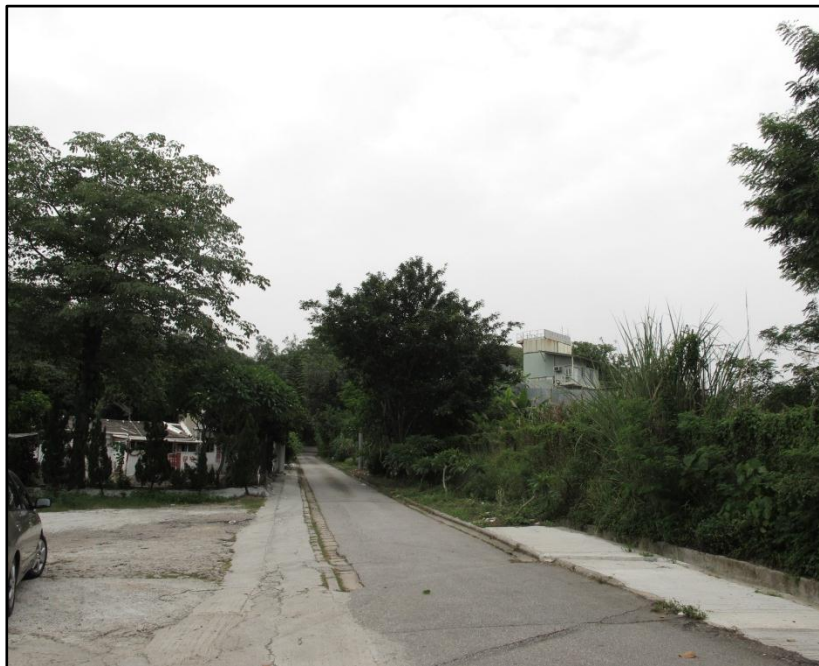
From R1 Residents of Villages along Man Kam To Road